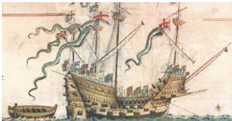
The Mary Rose as depicted on the Anthony Roll

1545: Mary Rose , a four masted warship, was built on the orders of King Henry VIII between 1510 and 1511. She was one of the first ships able to fire broadside, and was a firm favorite of Henry VIII. After a long and successful period of service, she sank on July 19, 1545. It is not clear whether or not a freaque wave caused the capsizing of Mary Rose , but reports say there was a breeze that sprang up suddenly, so a freaque wave is one of the possible causes. (Source: http://www.maryrose.org/lcity/history/history9.htm )