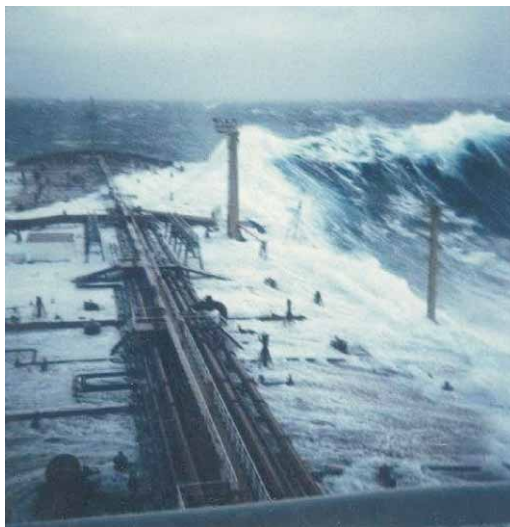
Picture by Philippe Lijour. (See http://www.math.uio.no/økarstent/waves/index_en.html )

1980: A huge wave was reported to have slammed into the oil tanker Esso Languedoc off the east coast of Durban, South Africa. (Source: http://www.abc.net.au/science/news/space/SpaceRepublish_1161681.htm )