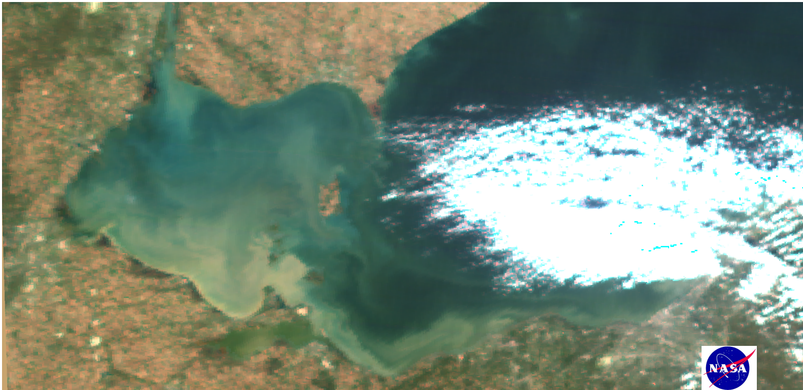
Figure 1. Truecolor from NASA's MODIS-Terra data collected 23 October, 2016 at 11:57 EDT.

The images below are "GeoPDF". To see the longitude and latitude under your cursor, select "Tools > Analyze > Geospatial Location Tool".